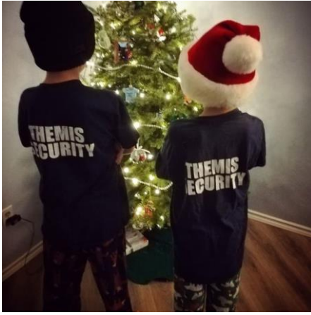
Happy Holidays and a safe and happy New Year from all of us at Themis Security!