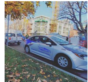
Thank you to SignPad for getting our car ready for the road!

This new addition will improve our response time and enhance our presence in the community.